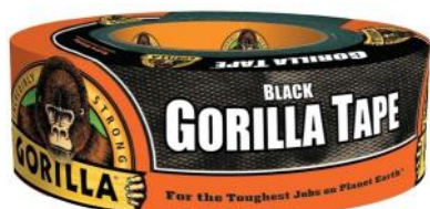
Gorilla Black Duct Tape 1.88 in x 35 Yards