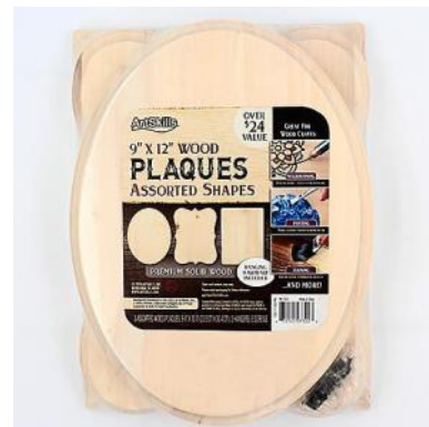
Art Skills Three 9" x 12" Wood Plaques Assorted Shapes