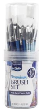
Art Skills Premium Brush Set, 40pc