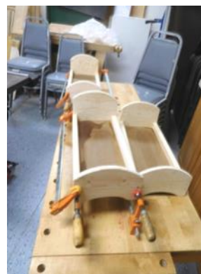
Finishing up a few more doll beds.