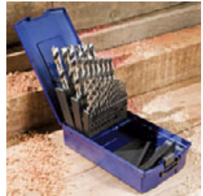
25-piece Brad-Point Bit Set