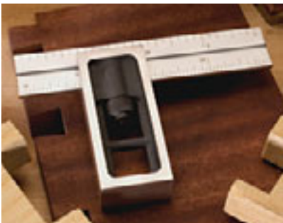
4 inch Double Square