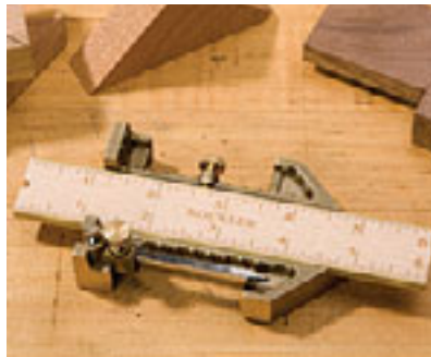
Odd Jobs Layout Tool