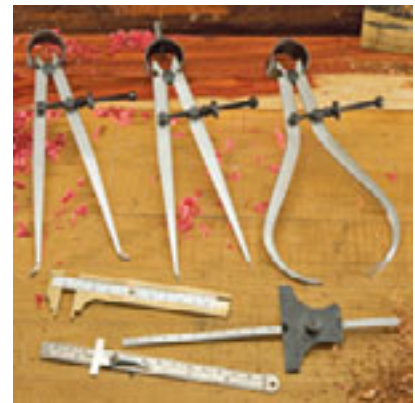
6-Piece Turning and Measuring Set