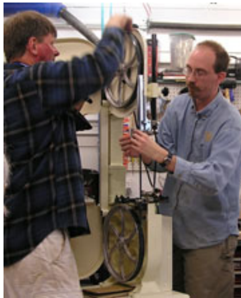
To properly adjust ...