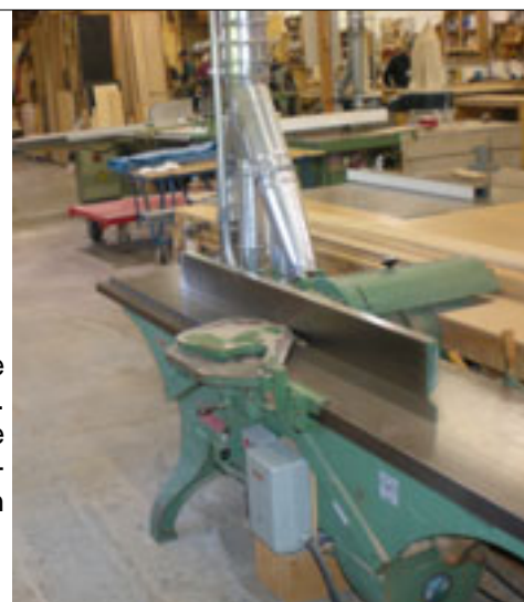
Photo from previous shop tour