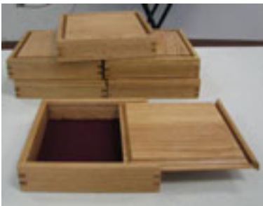
Memory boxes done by multiple wood workers.