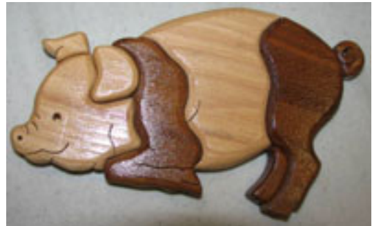
One of the intarsia pigs done at the wood working show.

Jim Vice of Vi-Tec showed us all the items he has invented for wood workers.