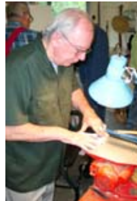
This box top was the scrollsaw SIG project for April. It really turned out great