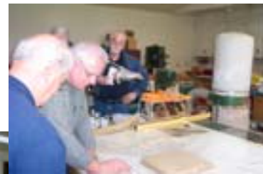
Looks like veneering was the topic in April