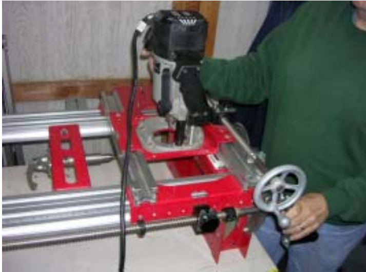
Floyd Gibson's new spiral turning machine being demonstrated at last months Novice SIG

Books, videos, and magazines are available to members for one month at a time when checked out of the Library at the back the meeting room. Be sure to return the items at the next meeting.