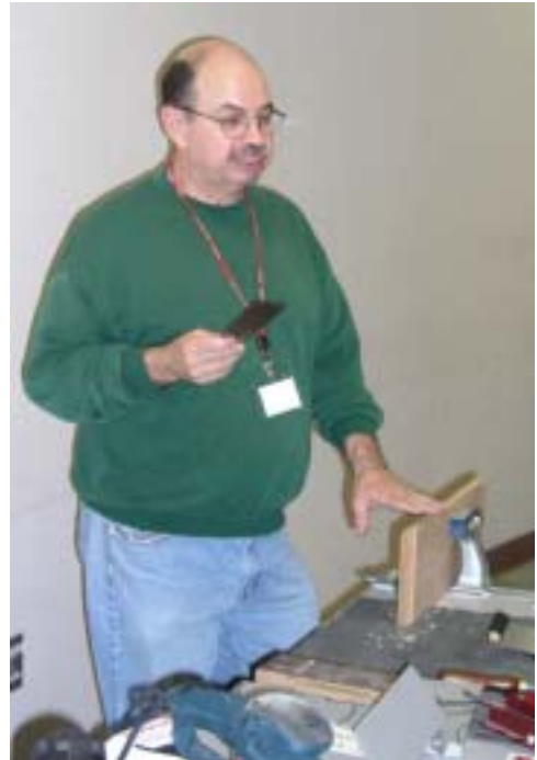
Sanding is the bane of woodworkers. Here is a demonstration of using a scraper