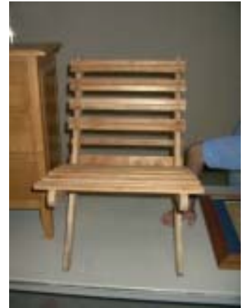
Abe Low, lawn chair, old but neat design. The back and seat pieces come apart for easy storage.