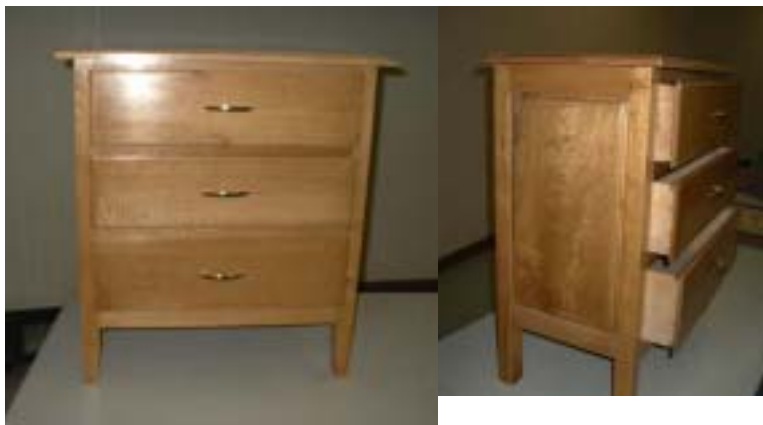
Bob Buckwalter, bedside chest of drawers, made of oak.