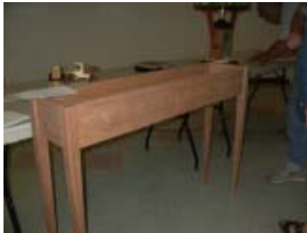
Henry Castaneda, hall table in progress, made out of eucalyptus.