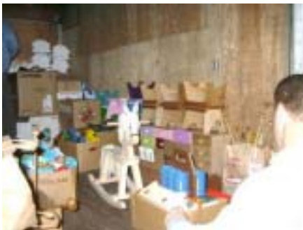
Loading the Salvation Army Truck